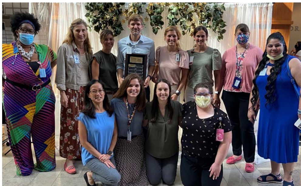
Clinicians and staff of Milliken Hand Rehabilitation Center, the 2022 WashU OT Team Awardees