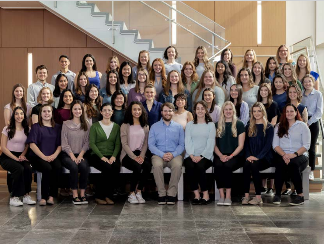
Clinical Doctorate of Occupational Therapy