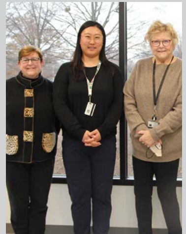
PhD in Rehabilitation and Participation Science