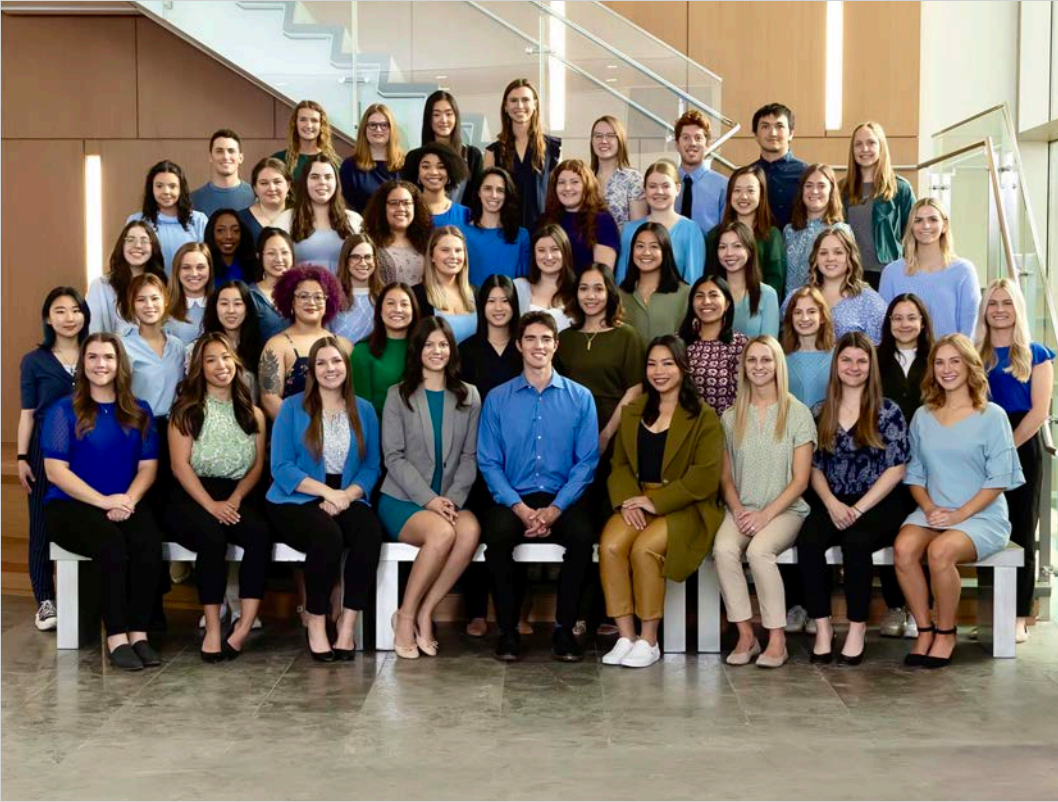
Master of Science in Occupational Therapy