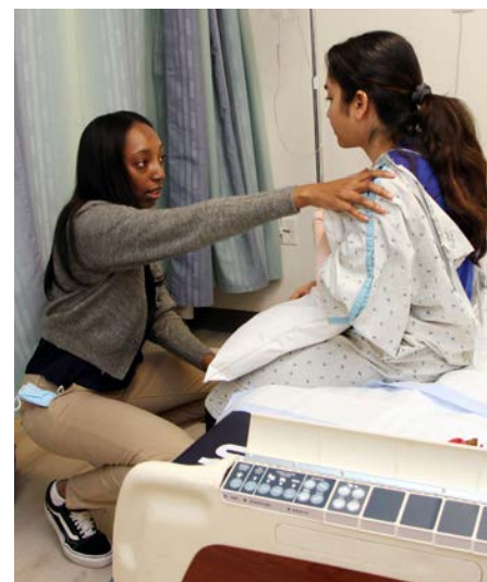
Inclusive approaches to clinical readiness include shifting the perception to clients as humans first before their medical case.

While enhanced inclusivity and anti-racism is a priority for the Program, the goal is to make “The Essential Elements of Inclusive OT Education” available digitally as an accessible resource for OT educators and the profession. “This document is not about what we do or have done about this shared value and core mission. This document is about what we want to really hold ourselves accountable to, our core commitment to the communities we serve,” Grajo says.