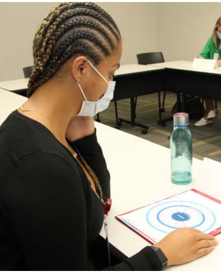
A student completes the Social Identity Wheel, a tool to map out the different intersections of social identities.