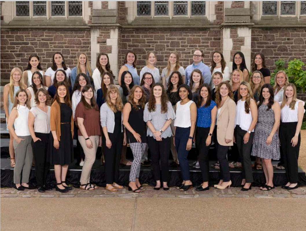
Clinical Doctorate of Occupational Therapy