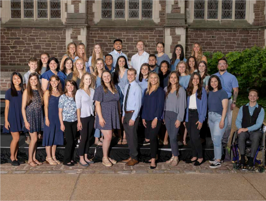
Master of Science in Occupational Therapy